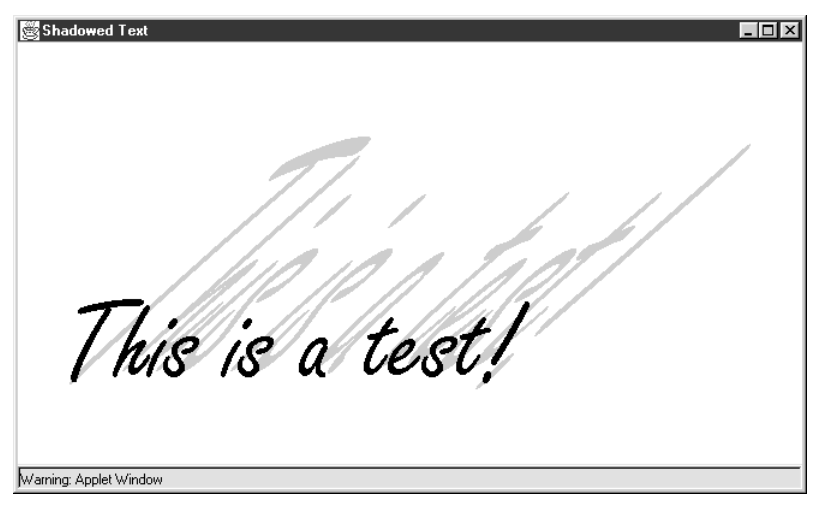
Figure 12-5 Result of pressing the "Open Frame" button in Figure 12-4.

12.3 Including Applets for the Java Plug-In