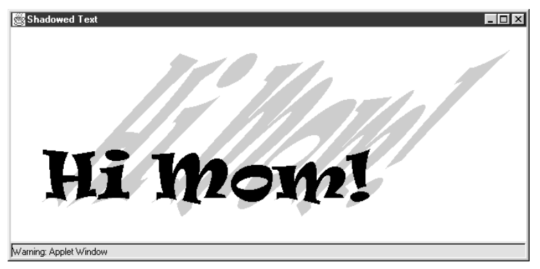
Figure 12-6 Another possible frame built by ShadowedTextApplet.jsp.