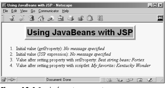
Figure 13-1 Result of StringBean.jsp.