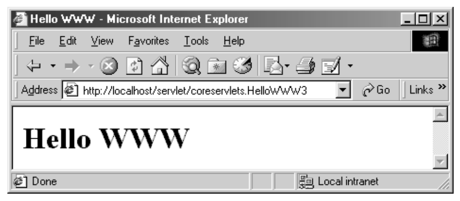
Figure 2-4 Result of the Hellowww3 servlet.