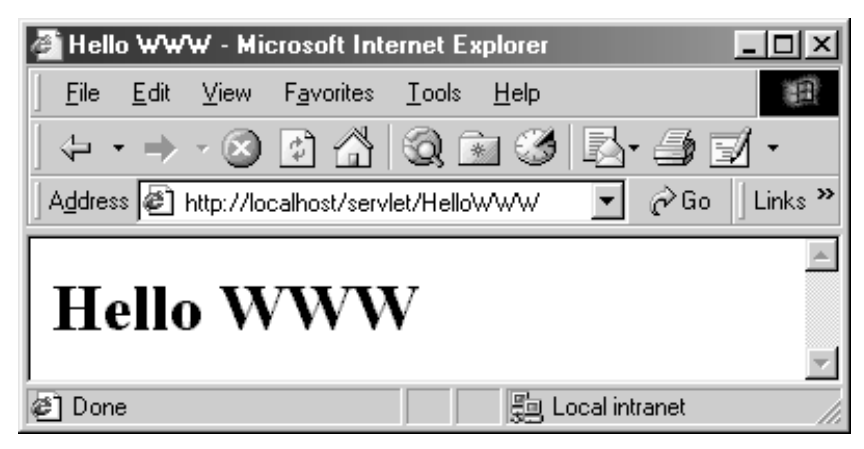
Figure 2-2 Result of Listing 2.3 (Hellowww.java).

and the way they're invoked. Let's take these areas one at a time in the following three subsections. The first two changes are exactly the same as with any other Java class that uses packages; there is nothing specific to servlets.