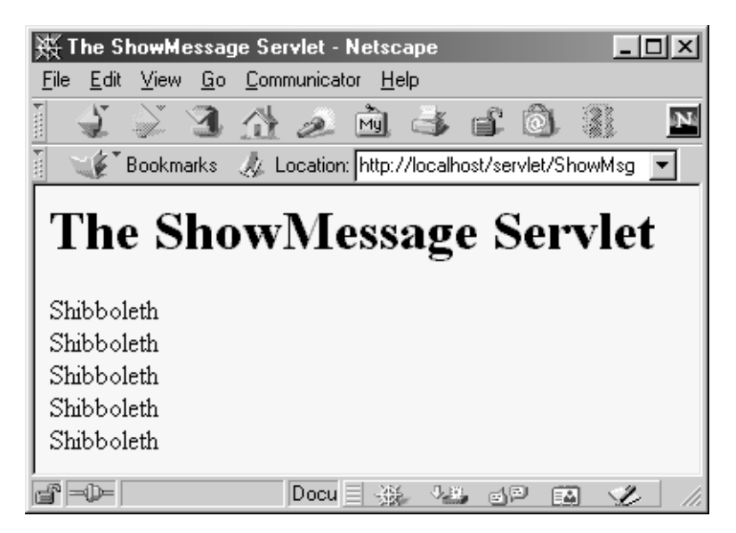
Figure 2-5 The ShowMessage servlet with server-specific initialization parameters.

Listing 2.9 shows the setup file used to supply initialization parameters to servlets used with Tomcat 3.0. The idea is that you first associate a name with the servlet class file, then associate initialization parameters with that name (not with the actual class file). The setup file is located in install_dir/webpages/WEB-INF . Rather than recreating a similar version by hand, you might want to download this file from http://www.core-servlets.com/, modify it, and copy it to install_dir/webpages/WEB-INF .