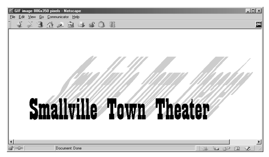
Figure 7-7 Using the GIF-generation servlet to build the title image for a site describing a local theater company.

7.5 Using Servlets to Generate GIF Images