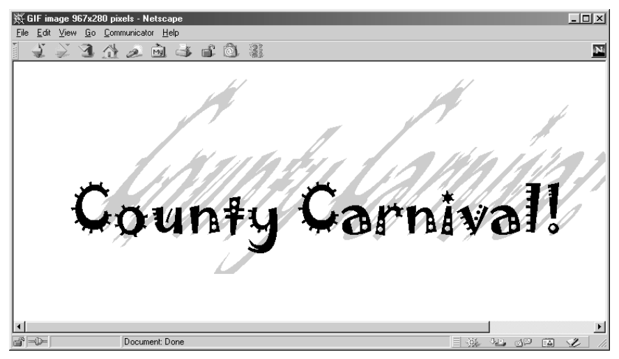
Figure 7-8 Using the GIF-generation servlet to build an image for a page advertising a local carnival.

Figure 7-7 Using the GIF-generation servlet to build the title image for a site describing a local theater company.